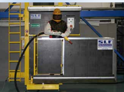
Sidewall-mounted swivelling lifting platform in a blastroom.