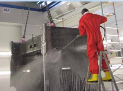
High-pressure cleaning cabin with process water treatment.