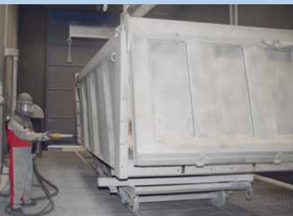
Blastroom with mechanical media transport system.