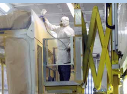
Scissors-type lifting platform in a paint spraying cabin.