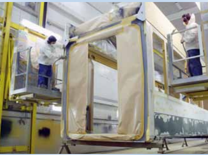
Combined paint spraying and drying cabin with sectional ventilation.